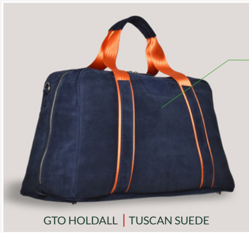
GTO HOLDALL | TUSCAN SUEDE