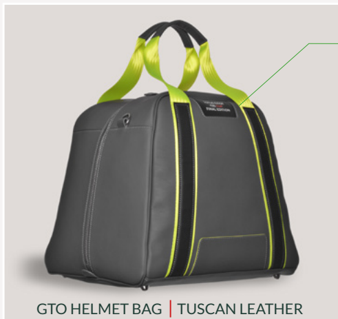
GTO HELMET BAG | TUSCAN LEATHER