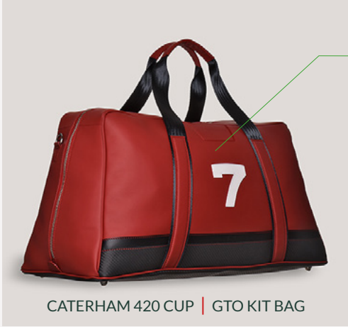
CATERHAM 420 CUP | GTO KIT BAG

DRIVERS, RACE TEAMS; WE CAN MATCH YOUR BRAND, COLOUR SCHEME/LIVERY WITH THE OPTION OF HIGHLIGHTING YOUR SPONSOR'S LOGOS/GRAPHICS