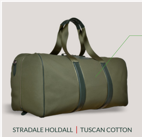
STRADALE HOLDALL | TUSCAN COTTON